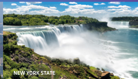
NEW YORK STATE